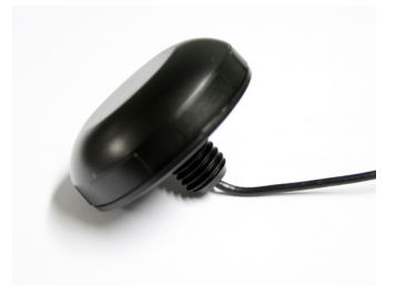
PR005 - Bulkhead Mount Antenna Includes an integrated mounting bolt with the signal wire coming out of the centre. Recommended for permanent installations.