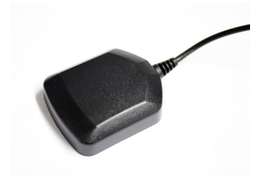
PR004 - Magnetic Mount Antenna Attaches to roof using a strong magnet. If required it may be fastened more securely using adhesive tape.

All G-Series units require an external antenna to receive the GPS signal. This is an additional item that must be purchased separately. There are two types of antenna available depending on the customer's requirements.